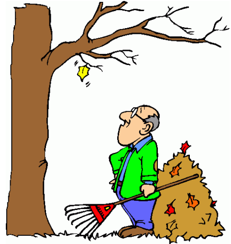
(This is our VP PR)