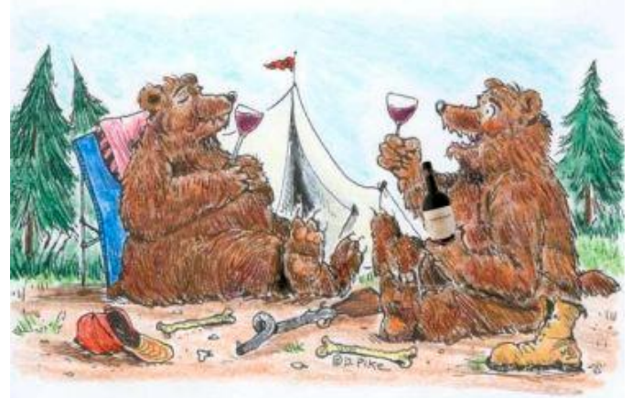
I finally remembered—red with hunter, white with fisherman.

The abnormality is that on your left side there is nothing right, and on the right side there is nothing left."