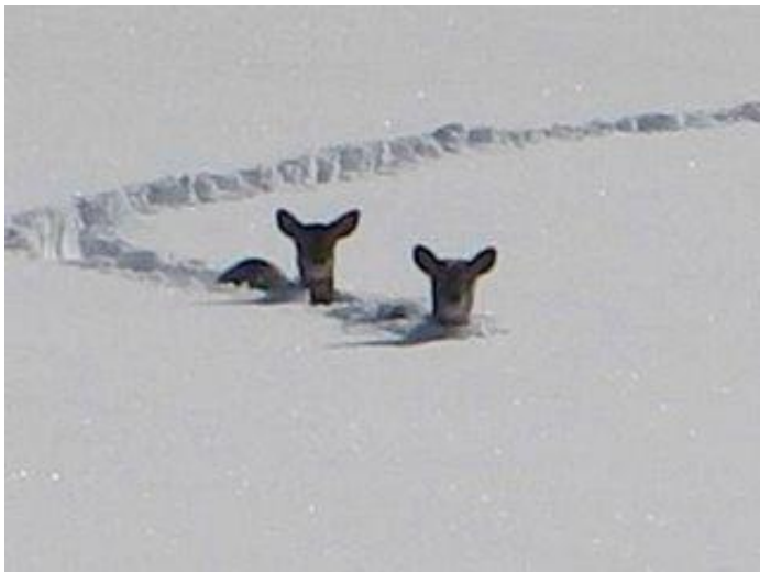
This could have been the snow during our meeting.

Money can't buy happiness -- but somehow it's more comfortable to cry in a Corvette than in a Yugo.